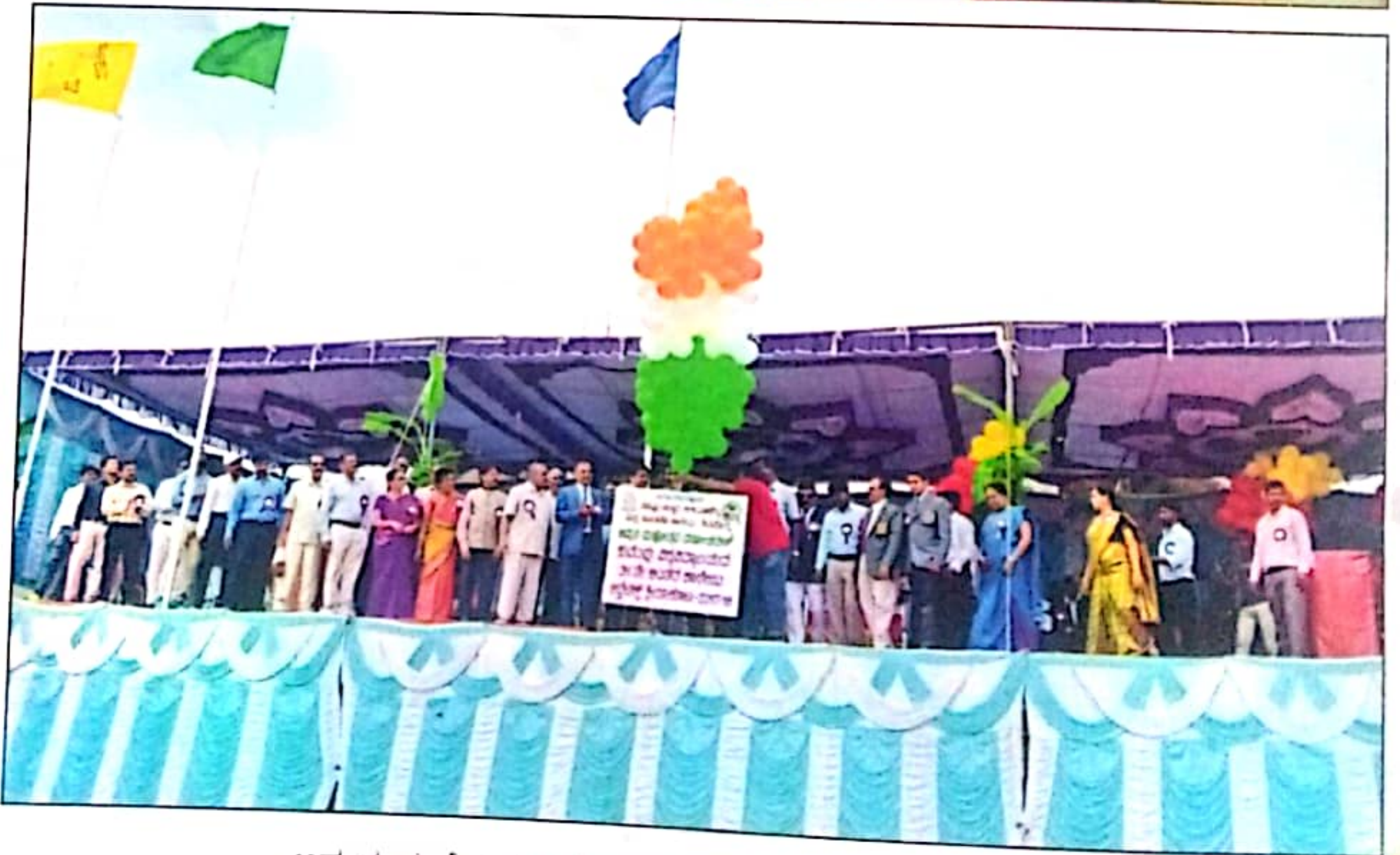
ಅಮೃತ ಮಹೋತ್ಸವ ವರ್ಷಾಚರಣೆ ಪ್ರಯುಕ್ತ ಕ್ರೀಡಾ ಸಮಾರಂಭ