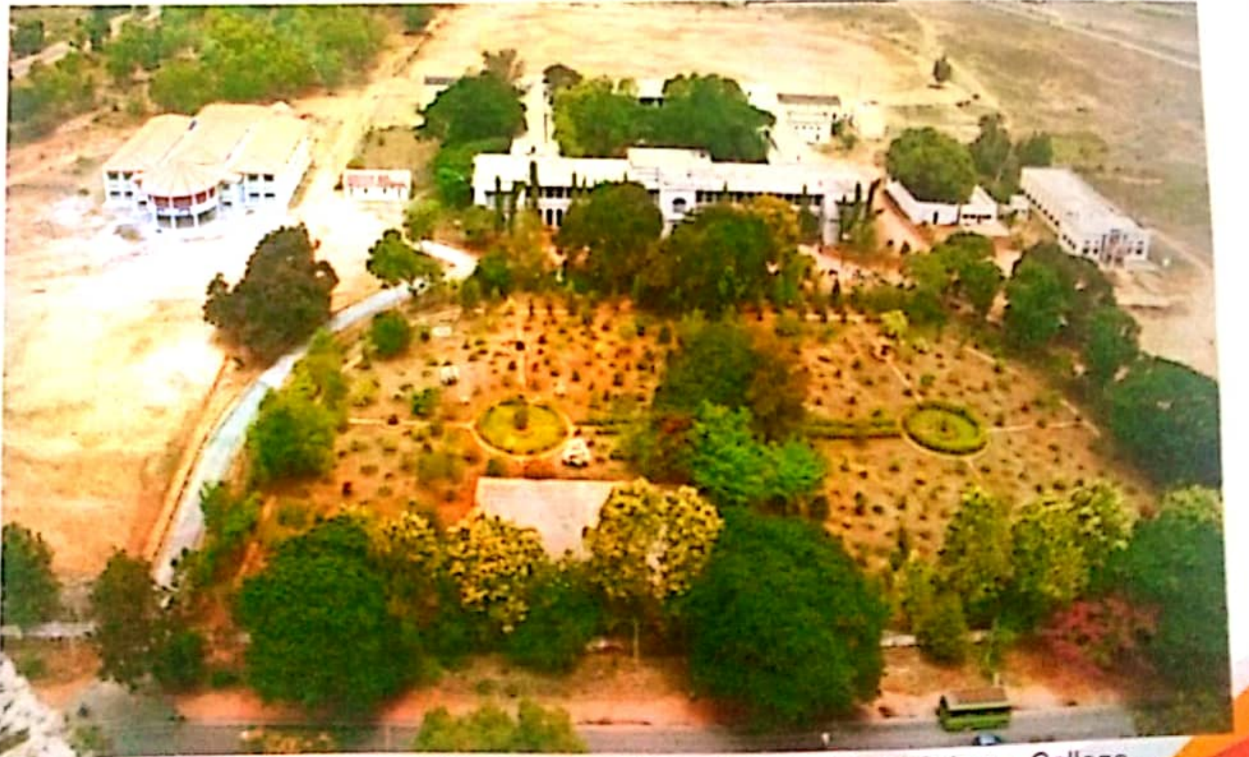
An Areal view of Sadbhavana Vana of the Sahyadri Science College

ಭಾರತ ಜನನಿಯ ತನುಜಾತೆ! ಜಯ ಹೇ ಕರ್ನಾಟಕ ಮಾತೆ! ಸರ್ವ ಜನಾಂಗದ ಶಾಂತಿಯ ತೋಟ, ರಸಿಕರ ಕಂಗಳ ಸೆಳೆಯುವ ನೋಟ ಹಿಂದೂ ಕ್ರೈಸ್ತ ಮುಸಲ್ಮಾನ, ಪಾರಸಿಕ ಜೈನರುದ್ಯಾನ ಜನಕನ ಹೋಲುವ ದೊರೆಗಳ ಧಾಮ, ಗಾಯಕ ವೈದಿಕರಾರಾಮ ಕನ್ನಡ ನುಡಿ ಕುಣಿದಾಡುವ ಗೇಹ, ಕನ್ನಡ ತಾಯಿಯ ಮಕ್ಕಳ ದೇಹ ಭಾರತ ಜನನಿಯ ತನುಜಾತೆ! ಜಯ ಹೇ ಕರ್ನಾಟಕ ಮಾತೆ! ಜಯ ಸುಂದರ ನದಿ ವನಗಳ ನಾಡೇ, ಜಯ ಹೇ ರಸುಮುಷಿಗಳ ಬೀಡೆ!