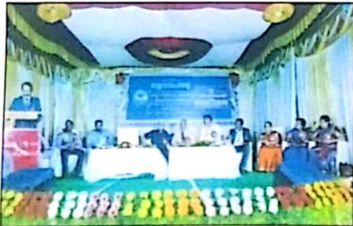
ಅಮೃತ ಮಹೋತ್ಸವ ವರ್ಷಾಚರಣೆಯ ಸಮಾರೋಹ ಸಮಾರಂಭ