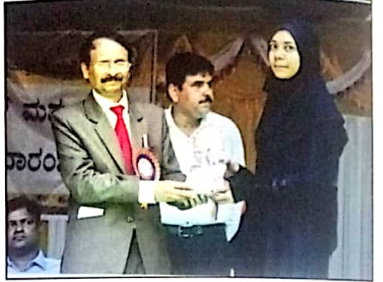
ಸನ್ಮಾನ್ಯ ಕುಲಪತಿಗಳಿಂದ ಪ್ರಶಸ್ತಿ ಪುರಸ್ಕೃತರಿಗೆ ಪ್ರಮಾಣ ಪತ್ರ ವಿತರಣೆ