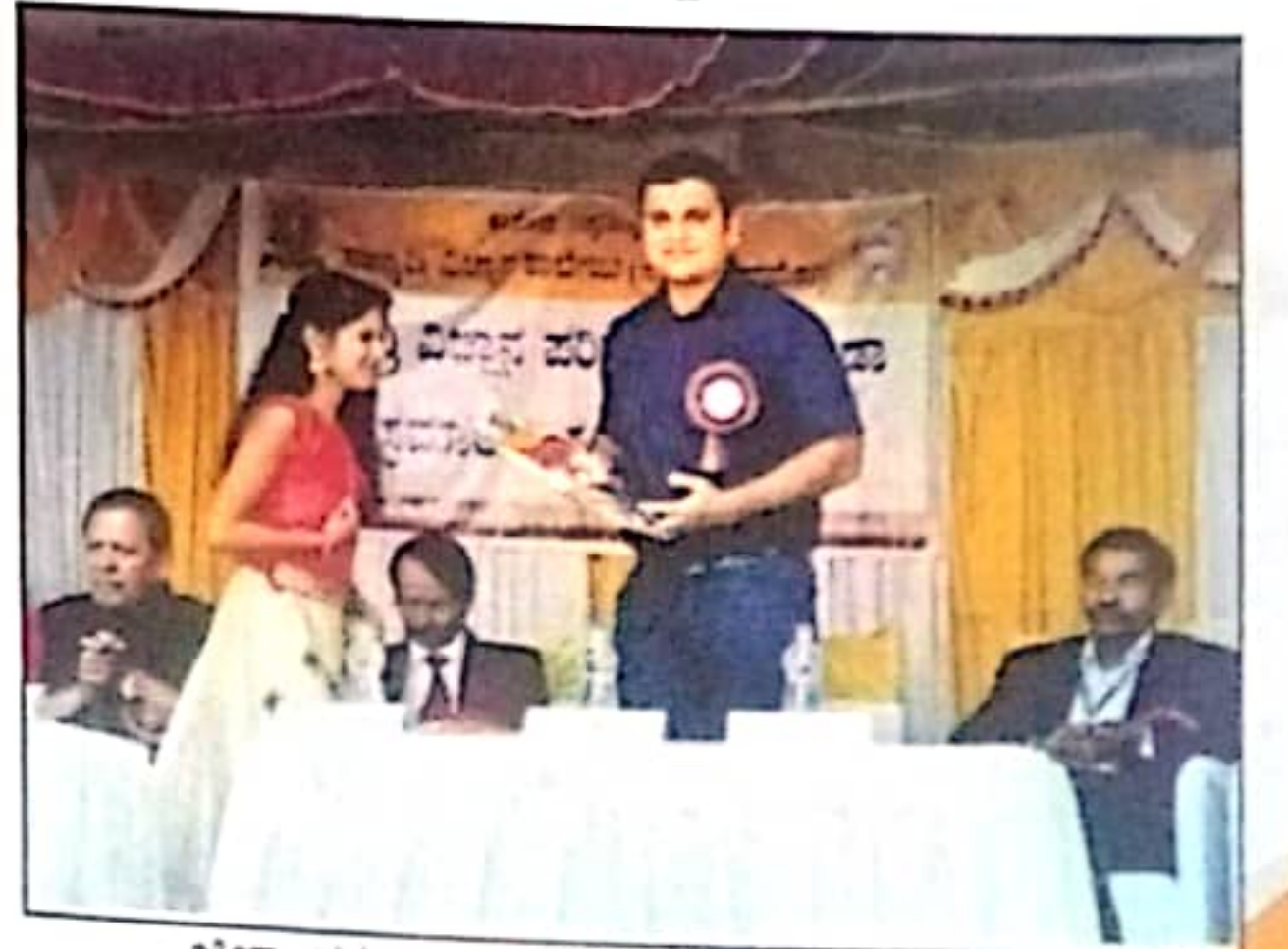
ಬೆಲ್ಲಾ ರಕ್ಷಣಾಧಿಕಾರಿಗಳಾದ ಅಭಿನವಬಿರೆಯವರಿಗೆ ಗೌರವಾಚರಗಳಿಂದ ಸ್ವಾಗತ