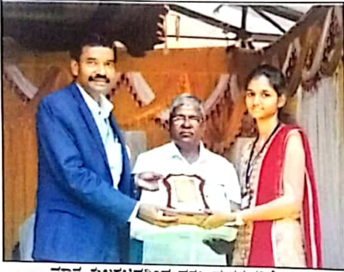
ಮಾನ್ಯ ಕುಲಸಚಿವರಿಂದ ಪ್ರಶಸ್ತಿ ಪುರಸ್ಕೃತರಿಗೆ ಪ್ರಶಸ್ತಿ ವಿತರಣೆ