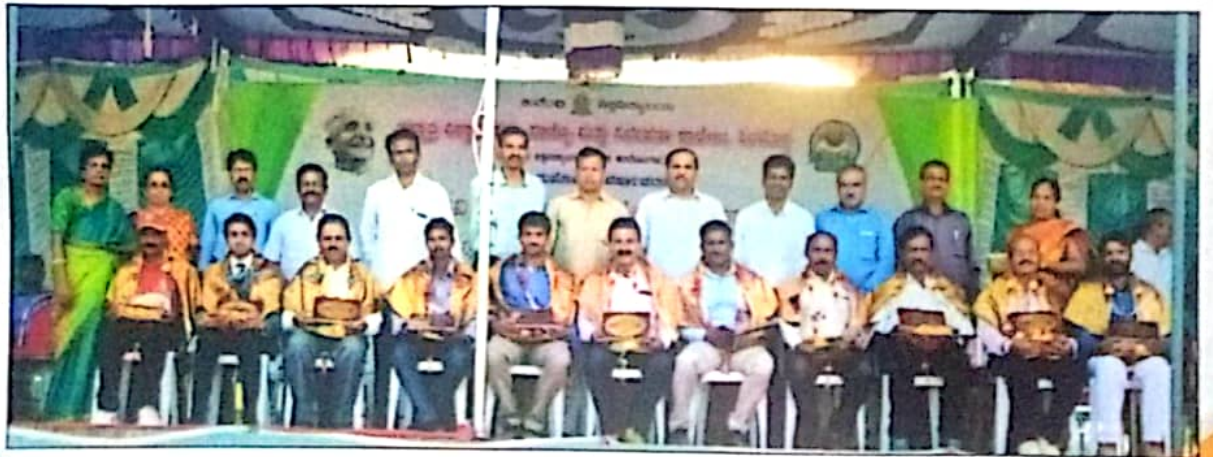
2017-18ನೇ ಸಾಲಿನ ವಿವಿಧ ಕ್ರೀಡಾ ಸಾಧಕರಿಗೆ ಸನ್ಮಾನ