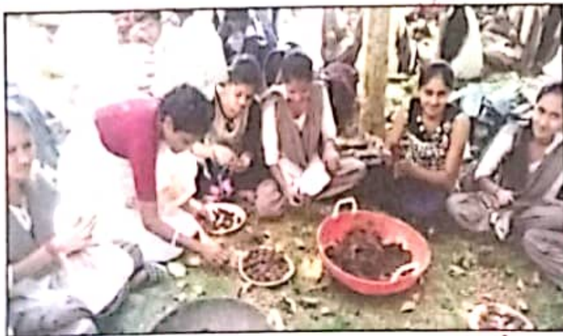
ಎಸ್.ಎಸ್.ಎಸ್. ಹಾಗೂ ಐ.ಕ್ಯೂ.ಎ.ಎ. ವತಿಯಿಂದ ಬೀಜದುಂಡು ತಯಾರಿಕೆ

Note : Fee structure subjected to University Modification