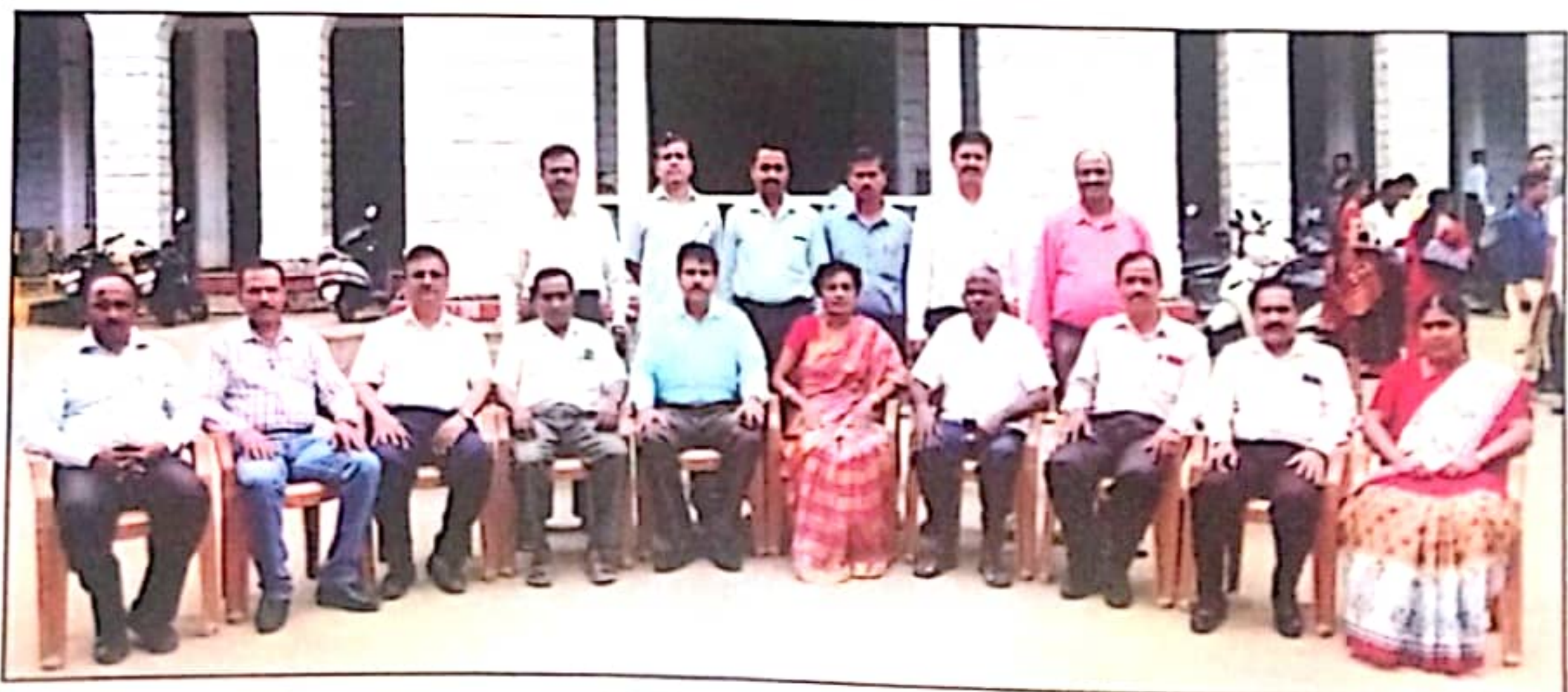
ವಿವಿಧ ವಿಭಾಗಗಳ ಮುಖ್ಯಸ್ಥರುಗಳು

Note : Fee structure subjected to University Modification