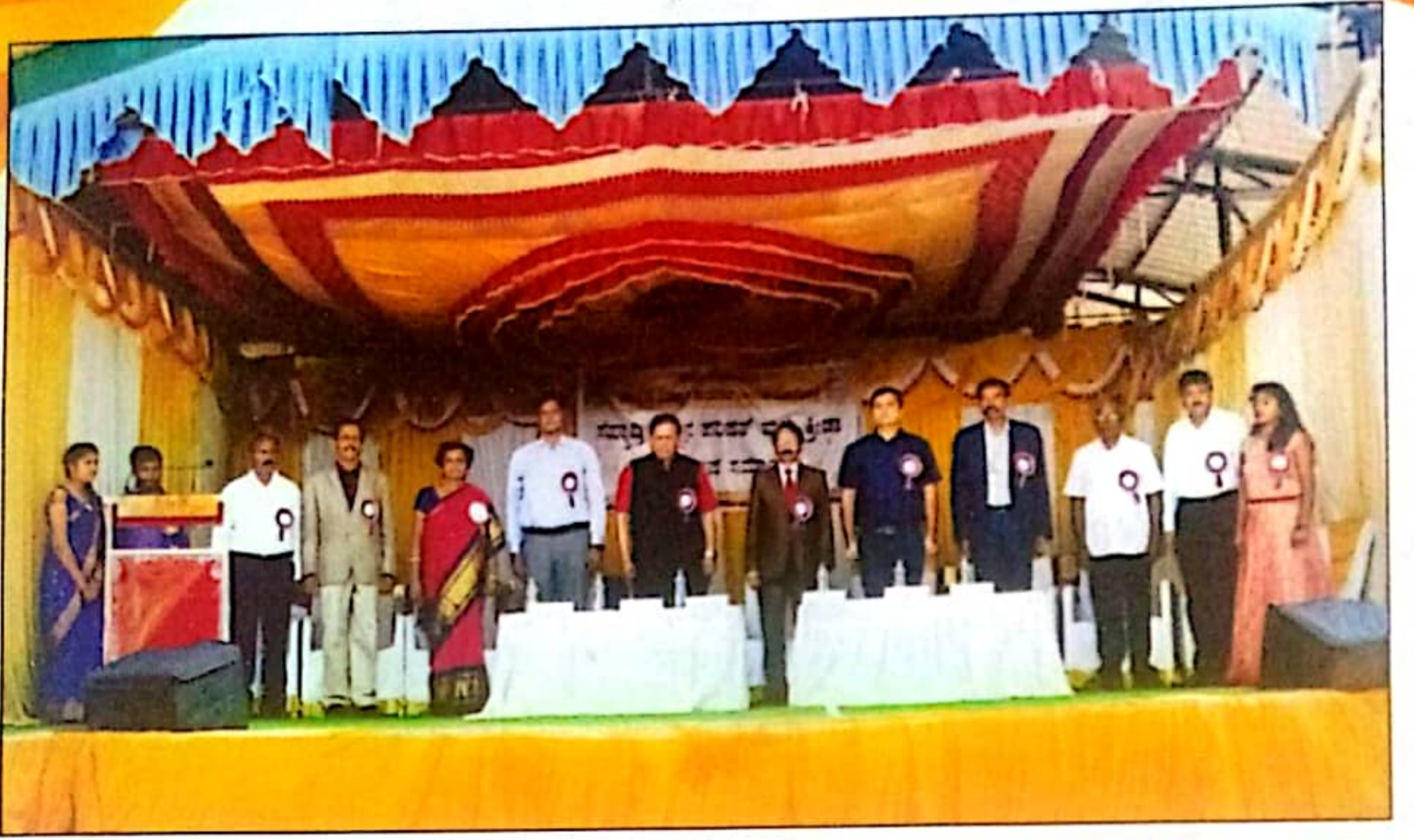
ವಿಜ್ಞಾನ ಪರಿಷತ್ ಹಾಗೂ ಕ್ರೀಡಾ ಸಮಾಲೋಚ ಸಮಾರಂಭ