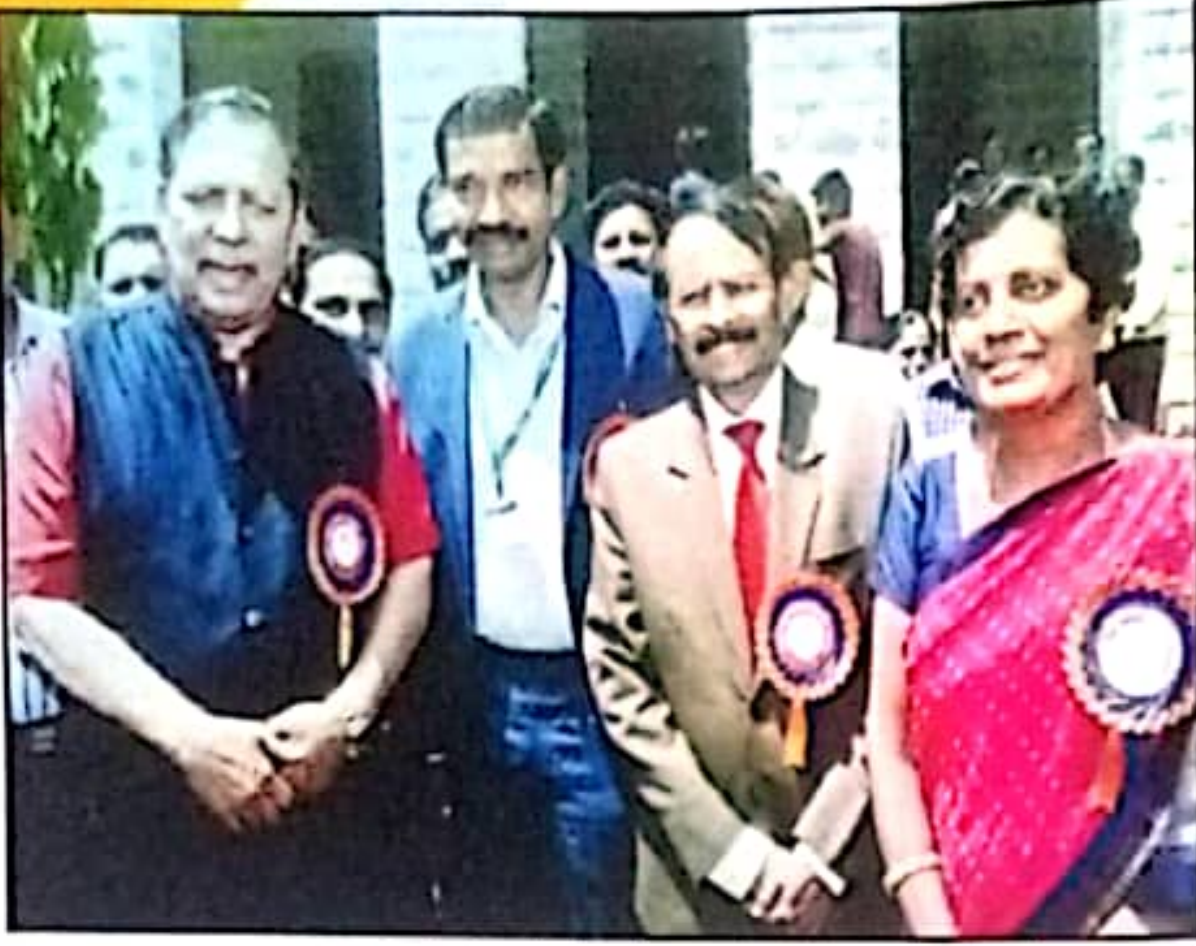
ವಿಜ್ಞಾನ ಪರಿಷತ್ ಸಮಾರೋಹ ಸಮಾರಂಭದಲ್ಲಿ ಡಾ. ಸಂತೋಷ್ ಹೆಗಡೆ ಹಾಗೂ ಮಾನ್ಯ ಕುಲಪತಿಗಳು, ಕುಲಸಚಿವರು