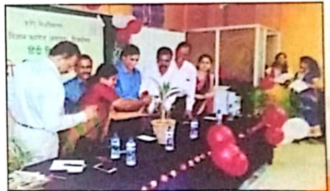
ಹಿಂದಿ ದಿವಸ್ ಆಚರಣೆ