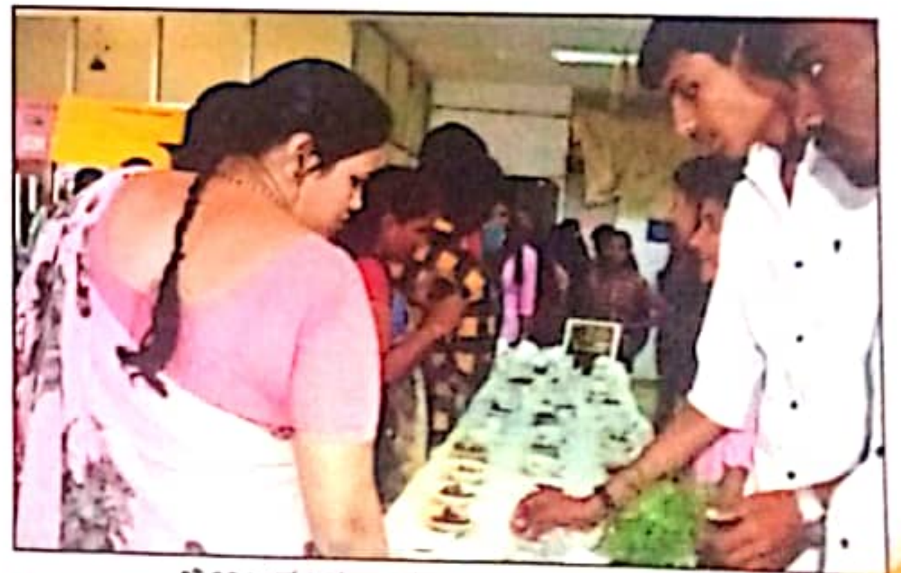
ಬೀಜ ತಂತ್ರಜ್ಞಾನ ವಿಭಾಗದ ವತಿಯಿಂದ ವಿವಿಧ ತಳಿಗಳ ಬೀಜ ಪ್ರದರ್ಶನ