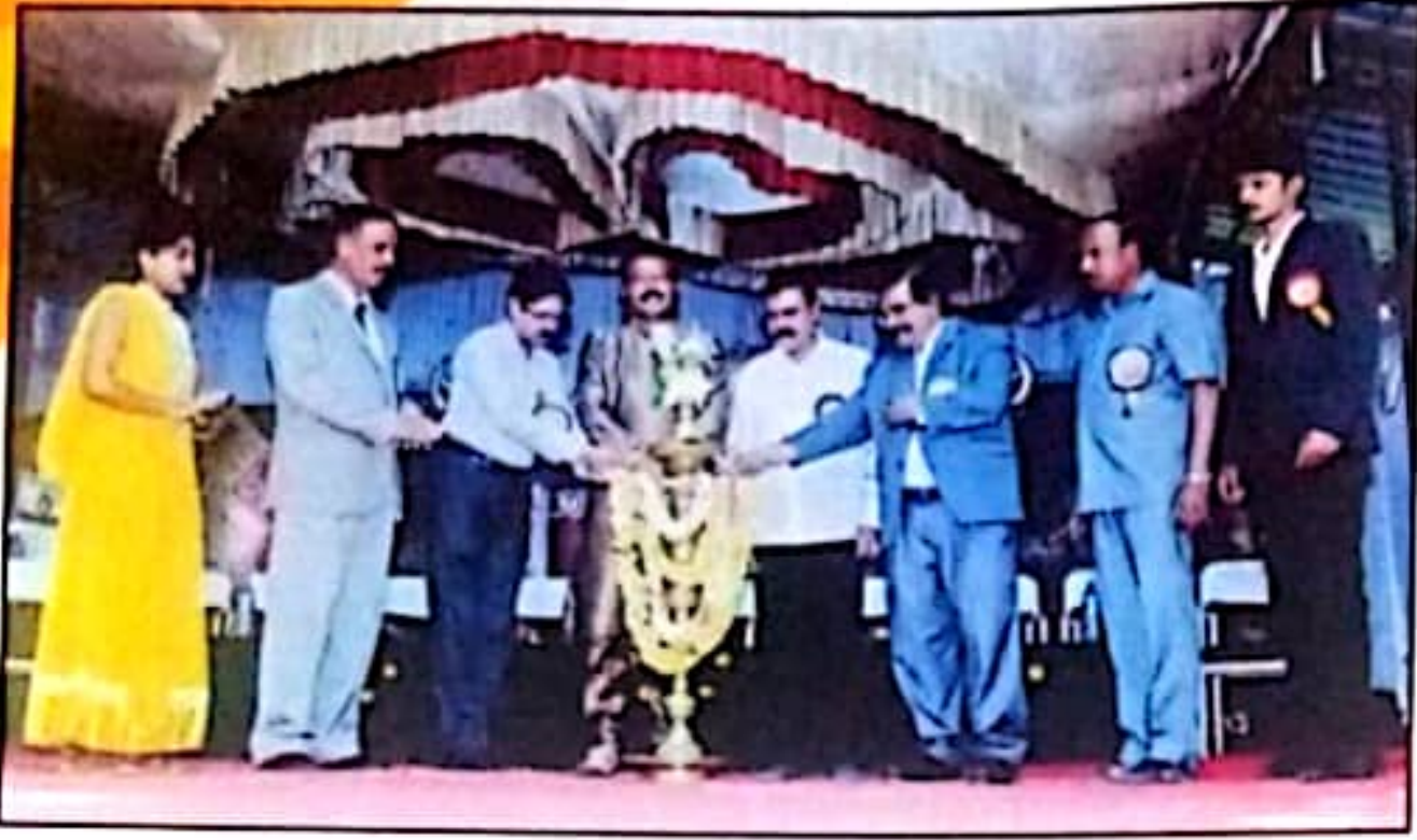
ವಿಜ್ಞಾನ ಪರಿಷತ್ ಉದ್ಘಾಟನಾ ಸಮಾರಂಭ