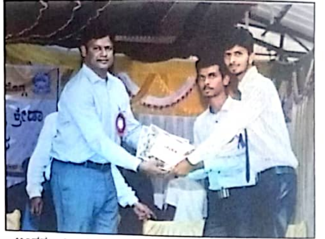
ಅಂತರರಾಷ್ಟ್ರೀಯ ಕ್ರೀಡಾಪಟು ದೊಡ್ಡಗಣೇಶ್‌ರವರಿಂದ ಕ್ರೀಡಾ ವಿಜೇತರಿಗೆ ಪ್ರಶಸ್ತಿ ವಿತರಣೆ