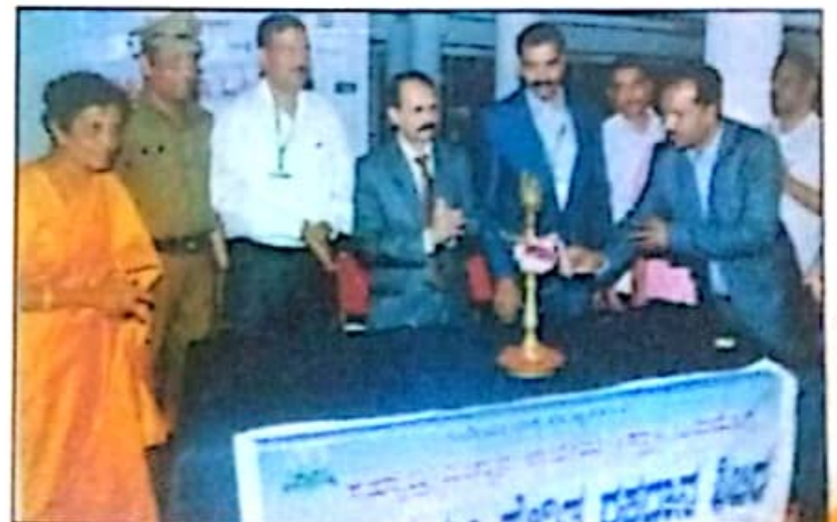
NSS, NCC, ರೆಡ್ ಕ್ರಾಸ್, ರೋವರ್ಸ್ & ರೆಂಜರ್ಸ್ ಪಡೆಯಿಂದ ಪವಿತ್ರಗೊಂಡ ರಕ್ತದಾನ ಶಿಬಿರದ ಉದ್ಘಾಟನೆ