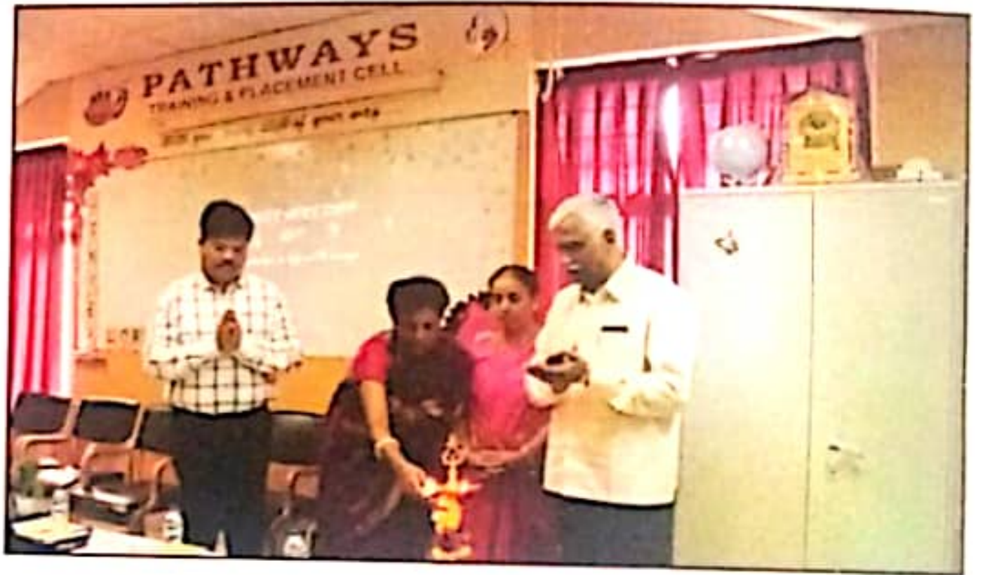
ಪಾಥ್‌ವೇಸ್ ವಿಂಟರ್ ವರ್ಕ್‌ಶಾಪ್