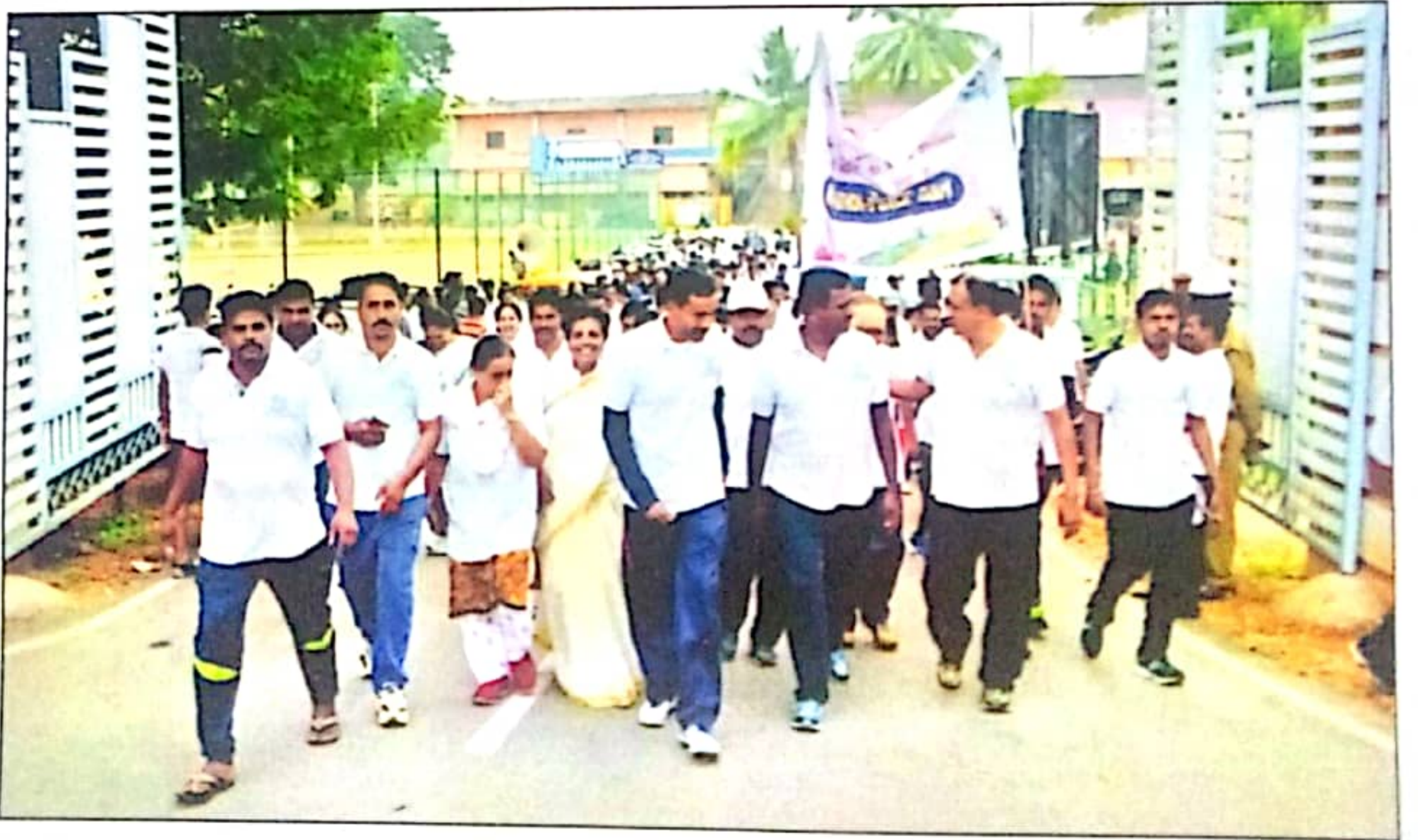
ಅಮೃತ ಮಹೋತ್ಸವ ವರ್ಷಾಚರಣೆ ಸಮಾರಂಭದ ಅಂಗವಾಗಿ ಸೌಹಾರ್ದ ನಡಿಗೆ